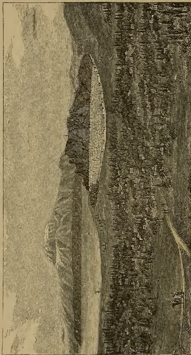
VAN, AND THE GARDENS. Lake Van. Mount Sapan, 14,000 feet high.